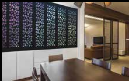
Color Changing LED Light Box 2' x 8' panels connected (7 side by side)