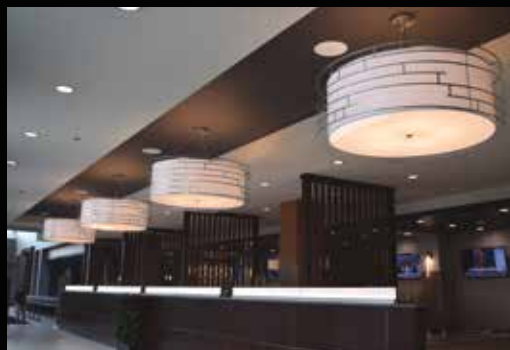
Laser Cut Steel and Fabric Drum Pendant Integrated LED Light Source 54" Dia x 18"Ht