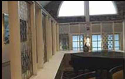
Steel Laser Cut Decorative Wall Panels 3' Wide x 8' High