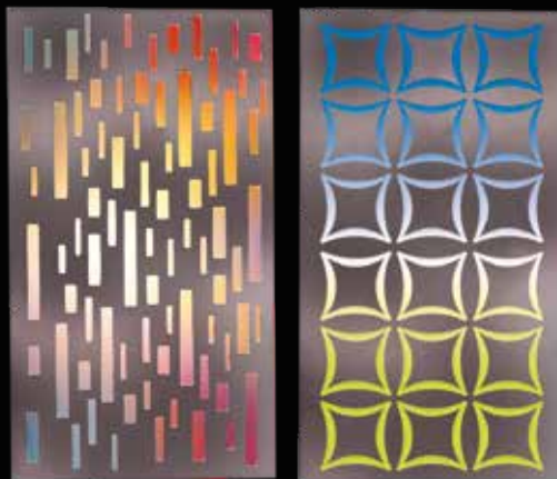
Customizable Laser Etched Designs

Our innovative pulsed laser technology allows for accurate and intricate cutting. Commonly cut materials include stainless steel, mild steel, brass, aluminum, wood acrylic and fabric. Contact our design team for size and thickness requests.