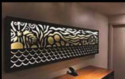
Wood Laser Cut Light Box with LED strip Lights 6' Long x 2' High

Our innovative pulsed laser technology allows for accurate and intricate cutting. Commonly cut materials include stainless steel, mild steel, brass, aluminum, wood acrylic and fabric. Contact our design team for size and thickness requests.