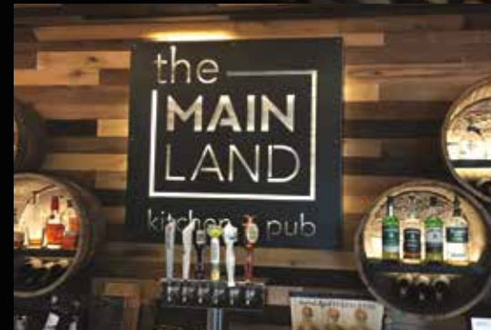
Steel Laser Cut Sign w LED strip lights 36" Square